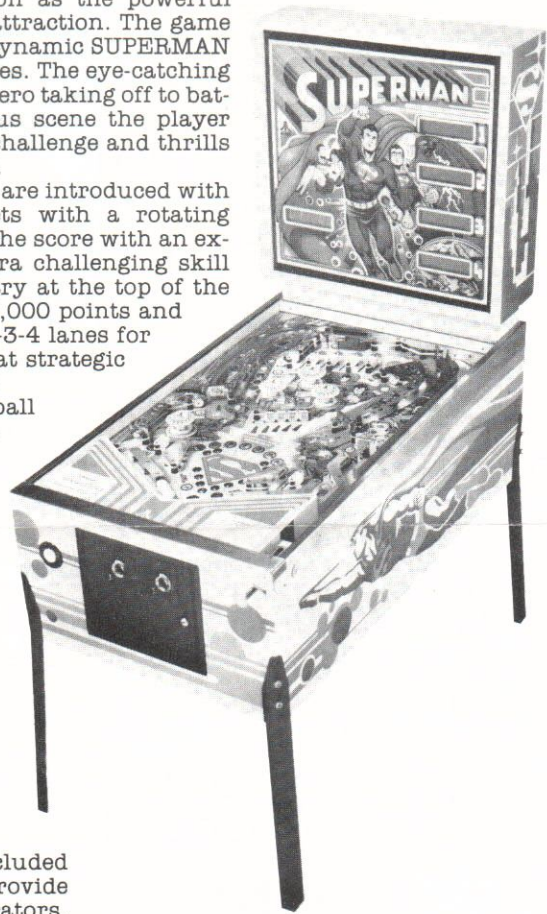
*SUPERMAN TM and © DC Comics Inc. 1979

The Atari game photo contest continues until July 6, 1979. (Details in the February issue of Coin Connection.) The winning photographer will receive an Atari Video Computer System for the best Atari game photo. We will be adding a special extra prize for the best photo with the Superman™* pinball game.