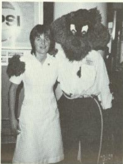
"Scanner the Cat" and a nurse from Trail Regional Hospital helped pass basketsful of goodies out to children everywhere.

During the holiday weekend, a costumed character called "Scanner the Cat" circu-