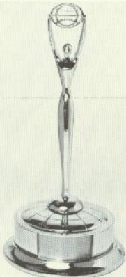
The CLIO statuette derived its name from Greek mythology after Clio, one of the nine muses, the Proclaimer, Glorifier and Celebrator of history, great deeds and accomplishments. She embraces a stylized globe of the world which represents "Advertising Excellence Worldwide."

*Dig Dug is engineered and designed by Namco Ltd., manufactured under license by Atari, Inc. Trademark and © Namco 1982.