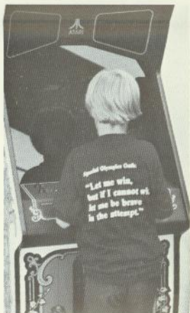
University of California at Berkeley June 24-26, 1983